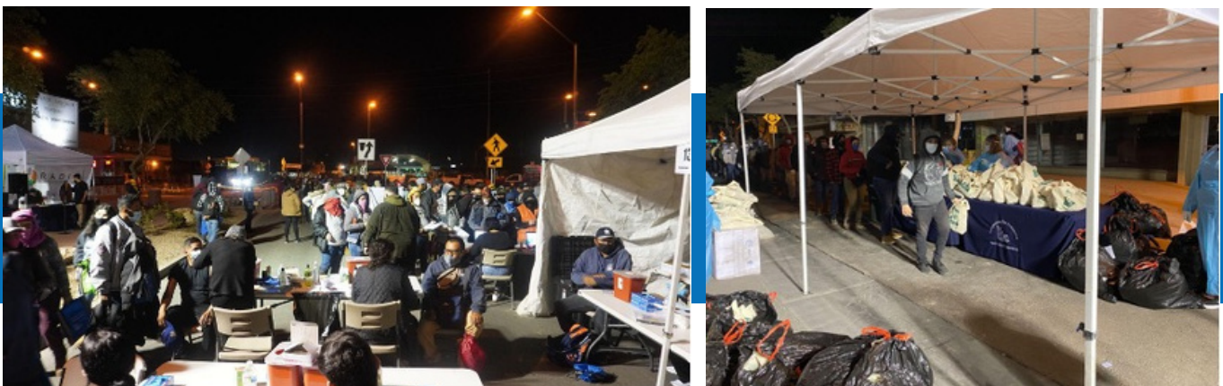
Information booths and giveaways at the “Dia del Campesinos” event

This annual event has been going strong in the community for over 27 years and is an essential tradition for the region’s farmworker community. The annual event allows farmworkers to safely connect with organizations that may otherwise not offer services in the early mornings, and it provides community organizations an opportunity to get to know the farmworkers in their area.