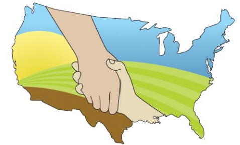
National Migrant & Seasonal Head Start Collaboration Office