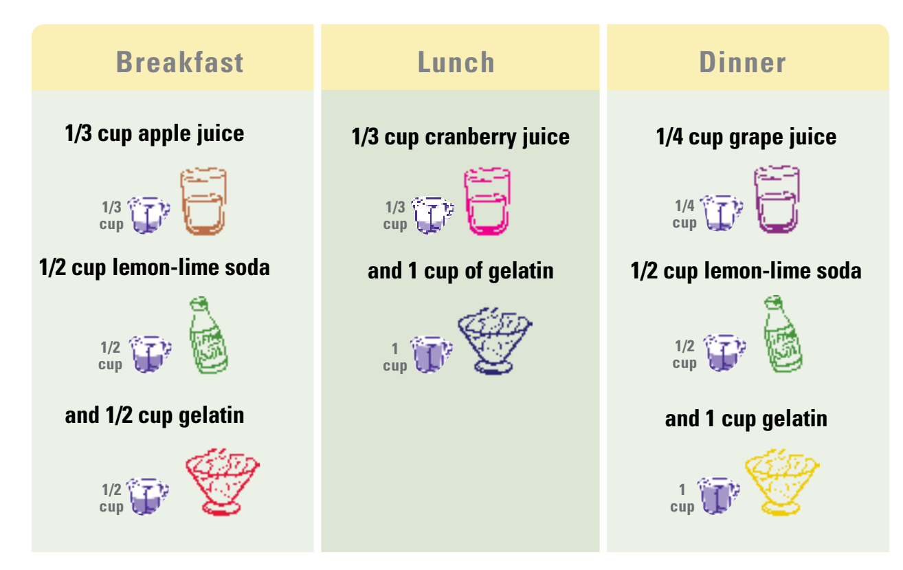
Broth is another clear liquid that is easy on the stomach. While you are sick, avoid citrus juices.