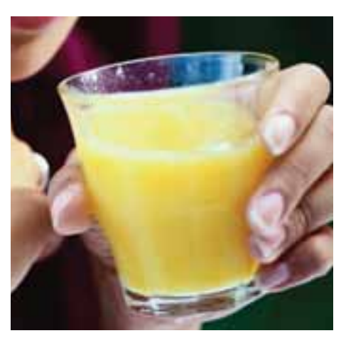
Drinking 4 ounces of orange juice can raise low blood sugar levels.

What should you do? Drink half a cup of sweet juice, such as orange or apple. Or quickly eat two spoonfuls of sugar or six to seven small hard candies. Be prepared – you should always carry candies or sugar packets with you. Once your blood sugar is raised and you start to feel better, take time to rest. If it is near your regular mealtime, eat a meal.