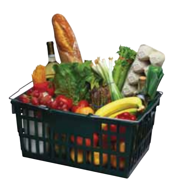
It's important to eat foods and beverages that are low in sodium (salt) to keep your blood pressure under control.

This habit helps to keep your blood pressure and cholesterol down.