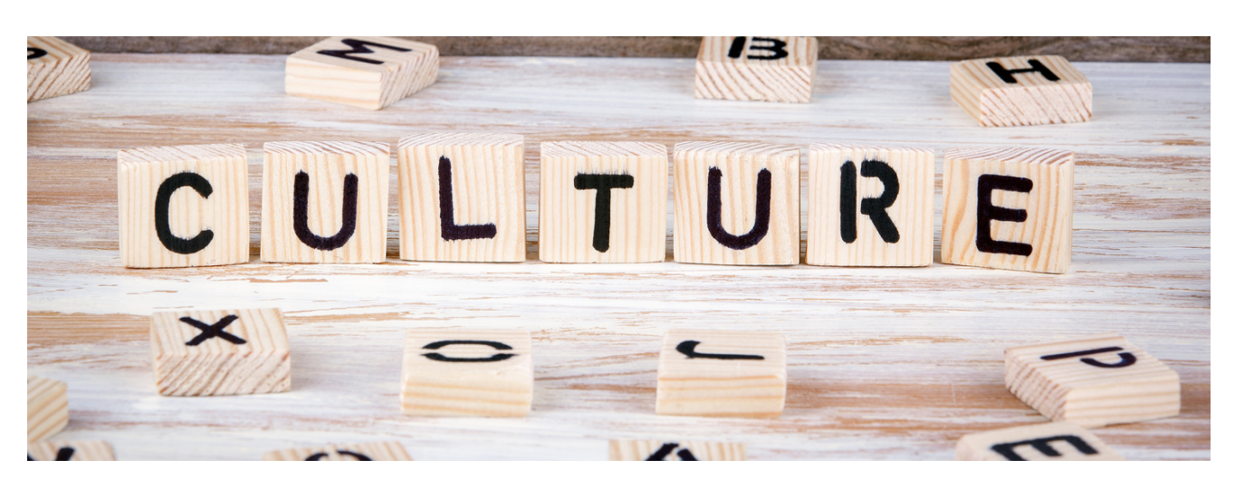
Cultural Strength-Based Frameworks and Protective Factors

Strength-based approaches promote resilience as opposed to dealing with deficits (Pulla, 2017)). Practitioners can gain their clients' trust and increase their commitment to the therapeutic process by using strength-based frameworks (Falicov, 2014). Traditionally, services offered to be marginalized, or minority communities have focused on difficulties or adversities, ignoring their current strengths. The concept of relational resilience changes the perspective of how we see Latinx clients and focuses on their potential to grow and recover from mental health conditions and adversities.